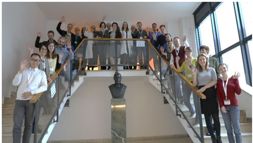
The attendees and faculty members of the EAA Winter School at the venue (Medical Faculty of Zagreb University).