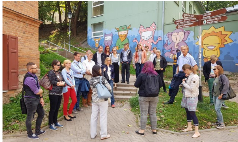
A group of participants enjoying a sightseeing walk around Tartu.